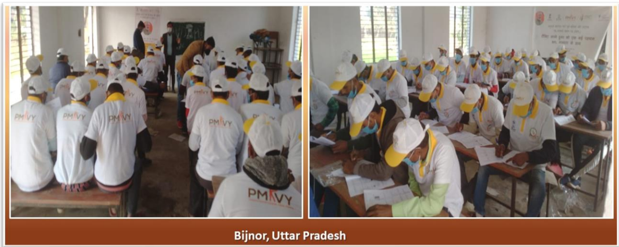
Bijnor, Uttar Pradesh