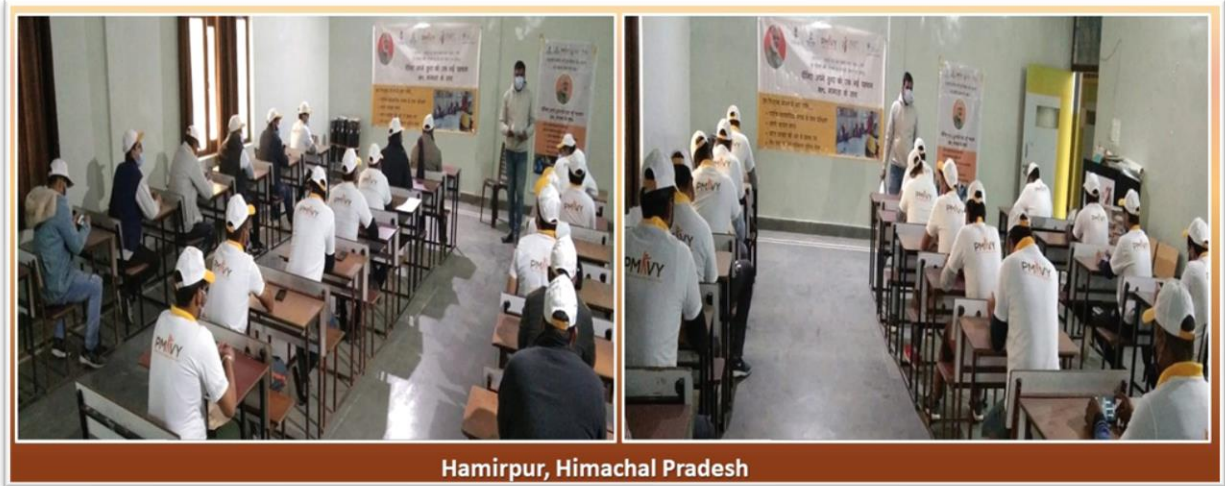
Hamirpur, Himachal Pradesh